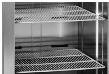
Heavy-duty epoxy coated shelves on LB models