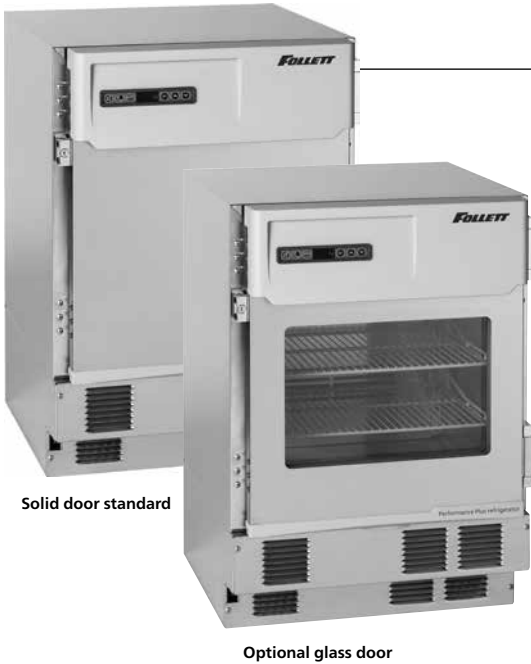
Solid door standard