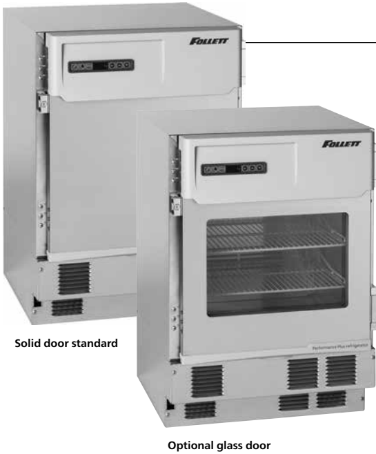
Solid door standard